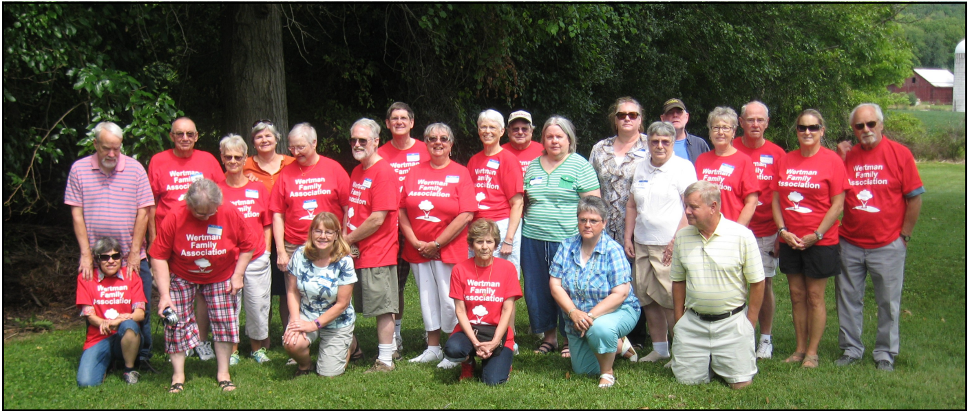
Wertman Family Association Annual Reunion, August 2015, Danville, PA, after the picnic.