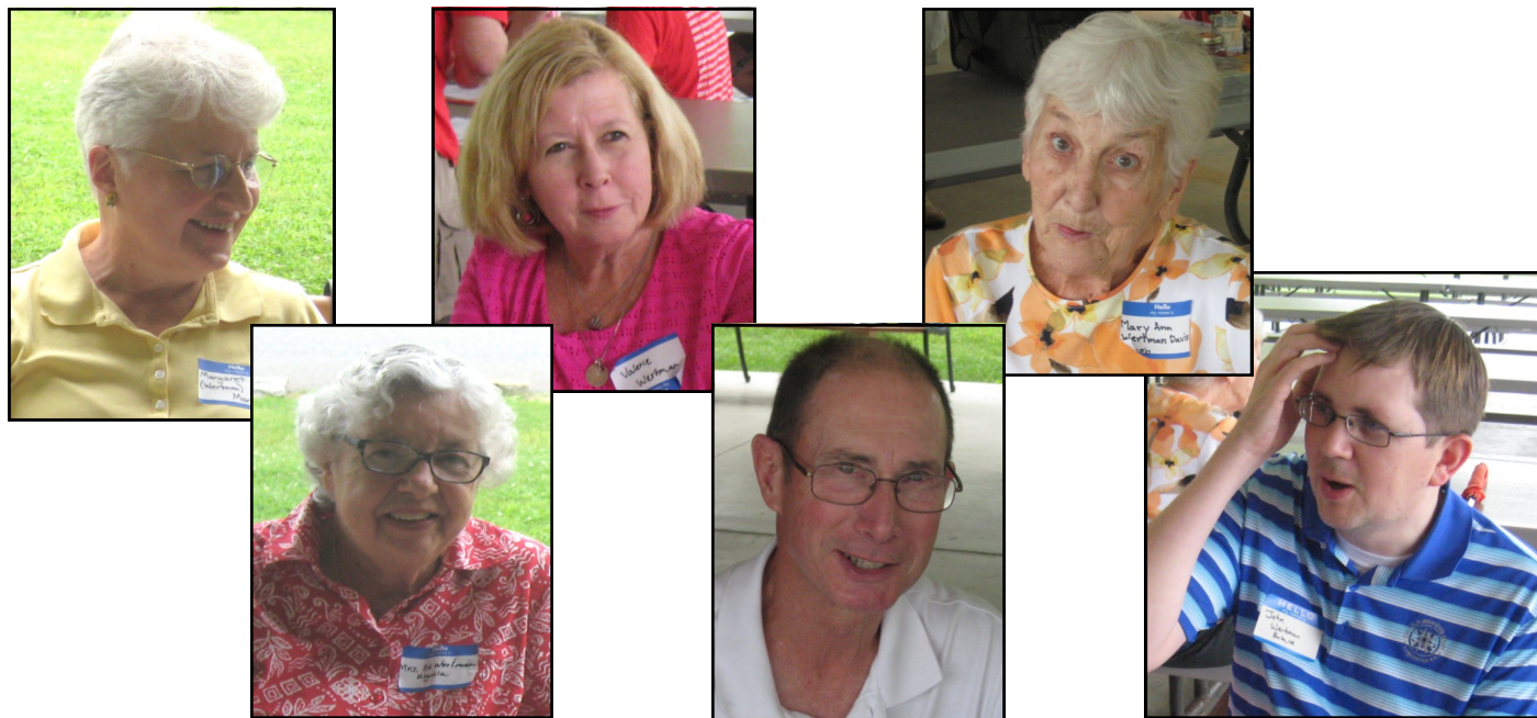
A good time was had by all at the 2017 Wertman Family Reunion picnic at Ontelaunee Park, New Tripoli, PA.