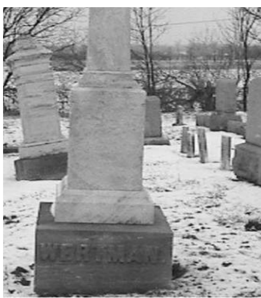
Wertman stones in the Stahler and Sheaffer cemeteries, Lockport.