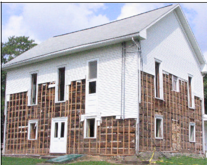
Renovations to St. James U.C.C. exposed the old log church. Early Wertmans in the Danville area probably supplied some of the logs for this early church building.