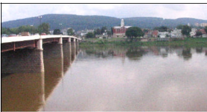
Above: The Susquehanna River was once congested with travelers and commerce. Right: Danville's former train station has been preserved as a garden/craft shop.