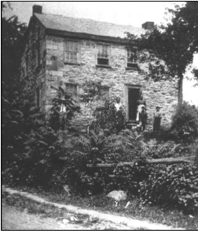
This old Wertman home still stands in Lynn Twp. at the corner of Gun Club and Lentz roads.