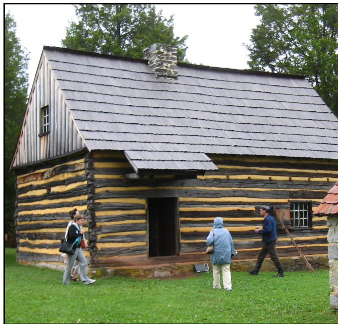
The Bertolet cabin at the Daniel Boone homestead is a typical log home built by early German settlers.

Step back into history at the north picnic area of the Daniel Boone Homestead, Birdsboro, PA. This is about a one-hour drive from the Microtel via Rte. 61 S, U.S. 222S, U.S. 422E and Daniel Boone Road. (GPS N 40° 17.46; W 75° 47.65) From 10:00 a.m. to Noon on Saturday, there will be time before the picnic to explore the Visitor Center and take a guided tour of restored period buildings such as the Boone House, which evolved from a one-story, English