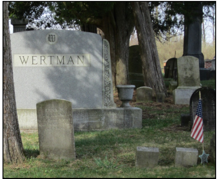
There are four generations of Wertmans buried in the Christ Lutheran Church cemetery, now within the locked gates of the Allenwood Federal penitentiary.