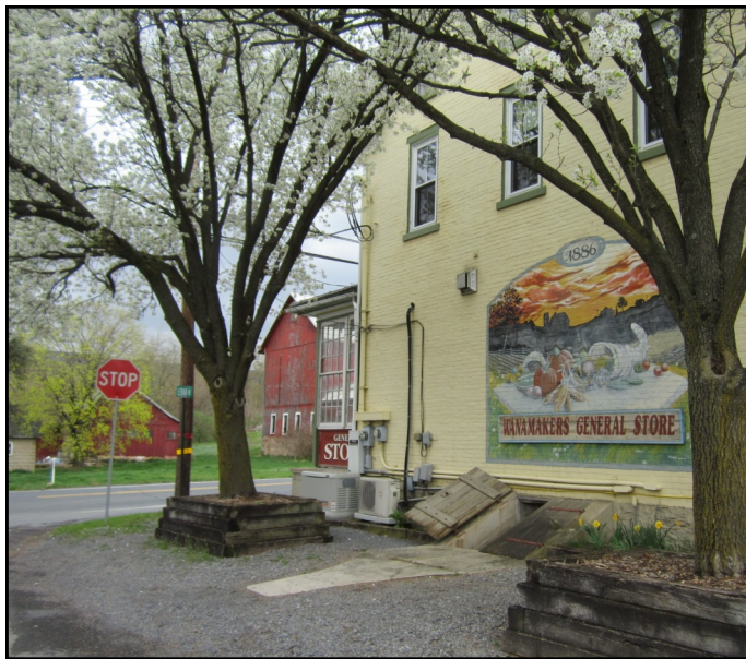
Step back in time at Wanamaker's General Store