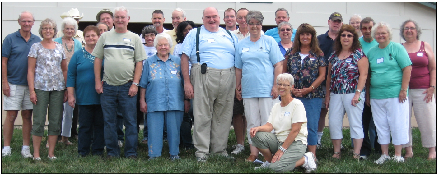
The 2012 annual Family Reunion picnic drew a crowd of Wertmans from IN, OH, MD, NY, VA, PA and RI.